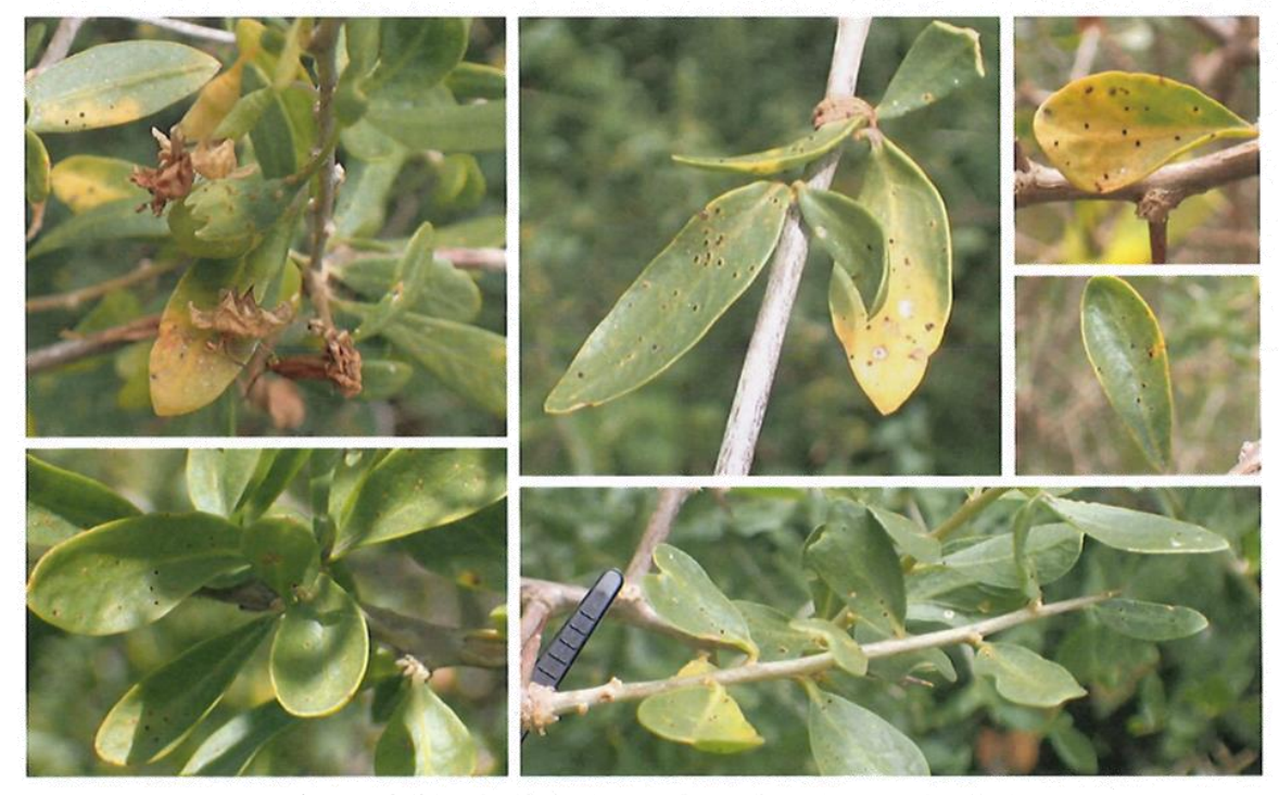
Infection of African boxthorn plants in the Southern Downs Region, QLD

In the Australian environment, the fungus is not expected to kill African boxthorn. Provided that the biocontrol agent establishes widely and causes severe disease symptoms on African boxthorn, it is expected to reduce the reproductive output and vegetation growth of the weed in the long term. This will in turn reduce its invasion potential in various ecosystems, but will not eradicate it altogether.