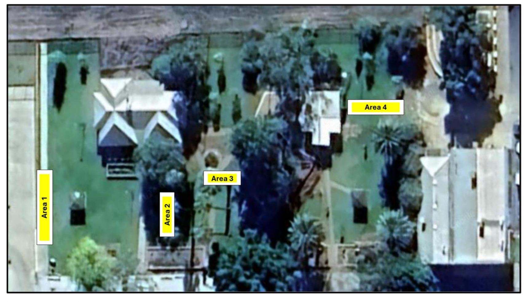
Davidson Park shade trees – Proposed planting areas