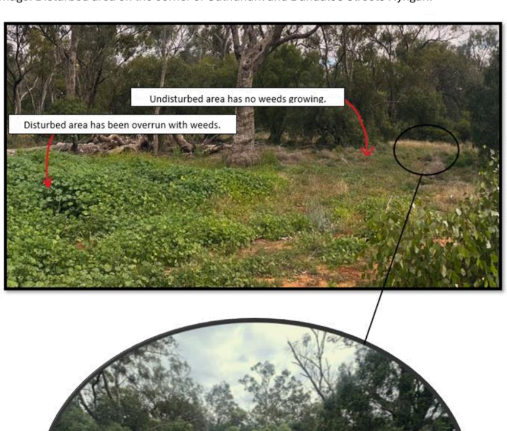
Image: Disturbed area on the corner of Cathundril and Dandaloo Streets Nyngan.