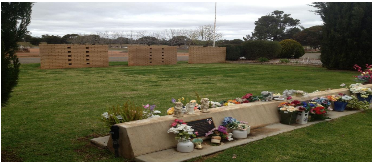
Type 1 Headstone