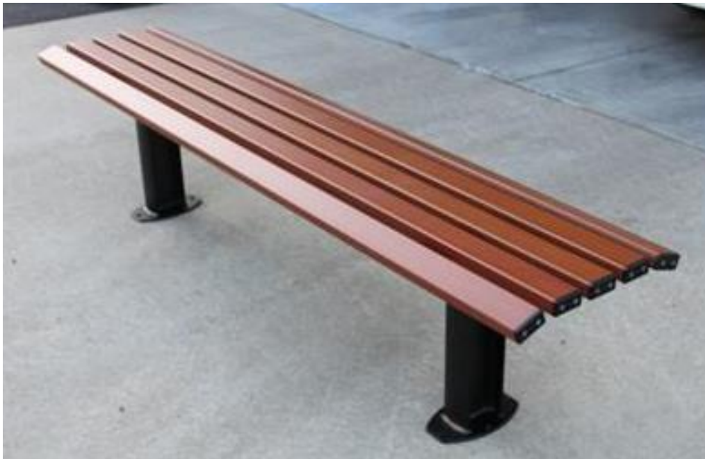
Above Photo: 2 Park Bench ( same timber finish as Nyngan Pool Park Seats )