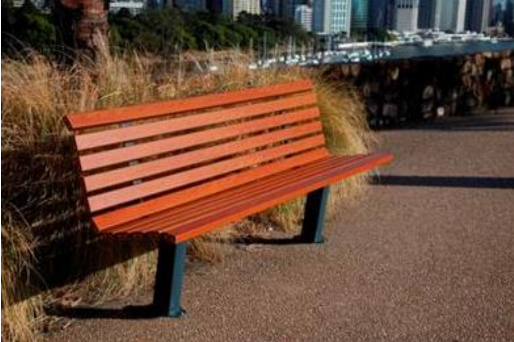
Above Photo: 1 Timber finished Park Seat ( same as 2013 installed Nyngan Pool Seats )