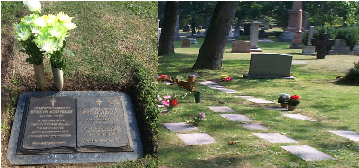
Type 2 Headstone