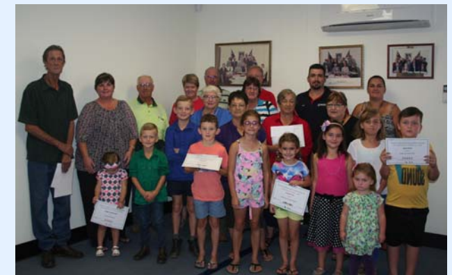
The Christmas Lights Competition 2015 winners.