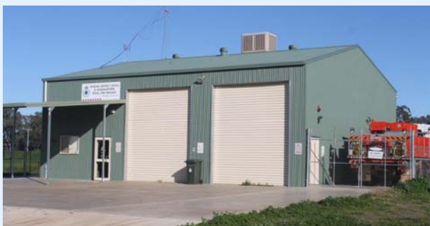
Council lobbied for the introduction of a Emergency Services Property Levy, which will be introduced by the NSW Government in 2017

Property-based Emergency Services Levy: Council, along with other Councils of our industry body, Local Government NSW, successfully lobbied for the introduction of a new, fairer system for collecting the levy that helps fund our community's fire and emergency services. In 2017 the NSW Government will introduce a new Emergency services Property Levy (ESPL) which will be paid by all property owners alongside council rates, and collected by local councils. The ESPL will replace the Emergency Services Levy (ESL) that is currently collected as part of all property-based insurance policies. The NSW Government has announced that from this date, insurance companies will no longer collect the levy as part of the property insurance premiums, and therefore, they believe, insurance premiums will be lower, allowing more people to afford to insure their homes and businesses. The reform will mean the burden of funding these services will no longer fall only on those with property insurance, but all landowners.