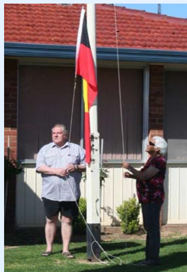
Council celebrates NAIDOC week each year. The Aboriginal flag is flown alongside the Australian flag outside Council chambers throughout the year.