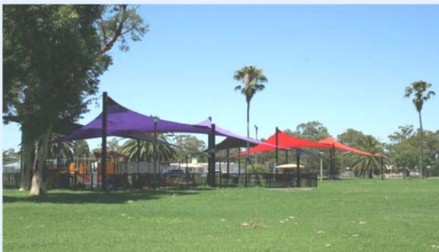
New playground equipment and shade shelters at O'Reilly Park.

Showground and equestrian facilities: There has been ongoing maintenance and improvement of the Nyngan Showground and equestrian facilities including a replacement of the watering system in the main ring and an extension of the watered area around the pavilions. With the assistance of showground users, Council has repainted the Wye Pavilion, the racecourse bar and the racecourse grandstand.