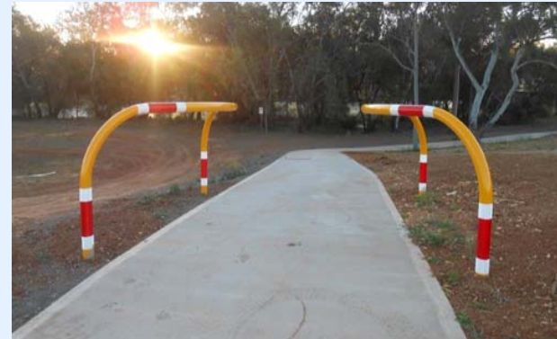
The footpath and bikeway network was extended in 2015 to connect the Bogan River precinct.