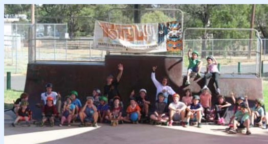
Youth week is celebrated in Nyngan each year.