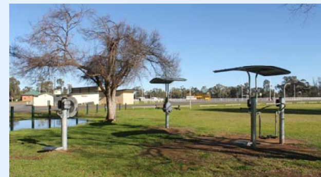
The fixed exercise equipment in Larkin Oval grounds.

Sportsgrounds and active recreational facilities: Council has carried out a regular maintenance program on the sports grounds and active recreational facilities to ensure they are well utilised. Raw water systems have been installed at Frank Smith Number 3 oval (operational) and Larkin Oval (in the process of being connected) to improve the playing surfaces in an environmentally sustainable manner. Fixed fitness equipment has been installed at Larkin Oval.