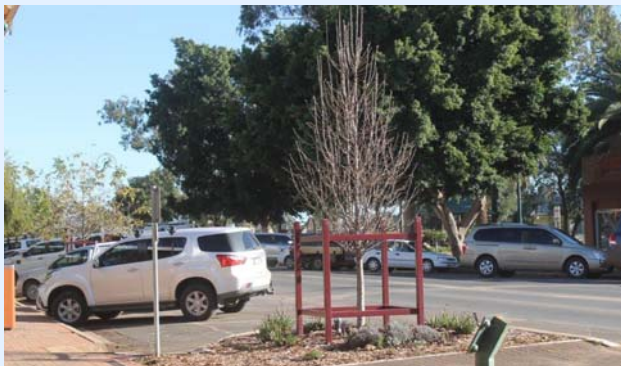
The Main Street Beautification scheme introduced nose-to-kerb parking, with additional spaces for disabled parking. Garden beds will provide extra shade in the summer months as well as visual appeal.