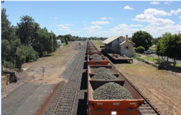
Freight rail remains a key way to export mining and agricultural produce from the Shire. Council is advocating for this to be increased.