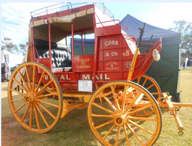
The Cobb and Co Coach has been housed in a purpose built shed at Teamsters Rest.