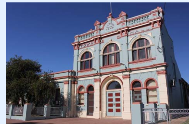
The Nyngan Town Hall was recently repainted.