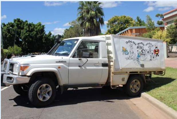
The specially fitted out Bogan Bush Mobile ute that transports all the equipment to the numerous rural and remote locations for play sessions.

Early Learning Centre: In 2015 Council applied for and received a $50,000 Federal Government grant to investigate the feasibility of centre-based day care for children aged 0-5 in the Bogan Shire. This study identified a need, and Council received a $450,000 grant to build a centre. Council contributed $1.2 million of its own funds to build the Bogan Shire Early Learning Centre (ELC) which opened in April 2016. The facility was built on council-owned land and project managed by Council staff. The ELC is licensed for 43 children aged 0-5 in two rooms. It is open for 50 weeks a year from 7.30am - 6pm. The ELC also houses and oversees the Bogan Bush Mobile Service.