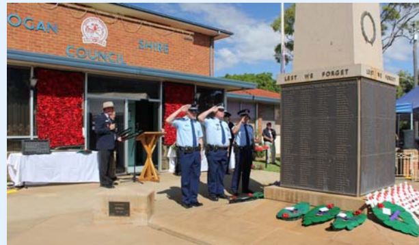
Council helps co-ordinate the Anzac Day service each year.