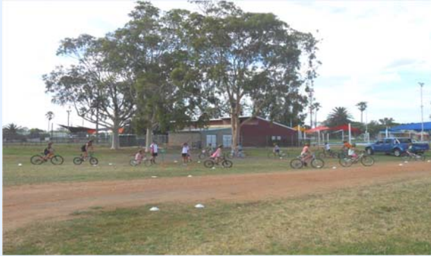
Bicycle safety workshop held at Larkin Oval