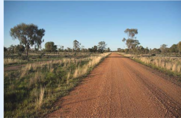
Council re-sheeted 120km of gravel road and constructed 20km of new road between 2012 and 2016.