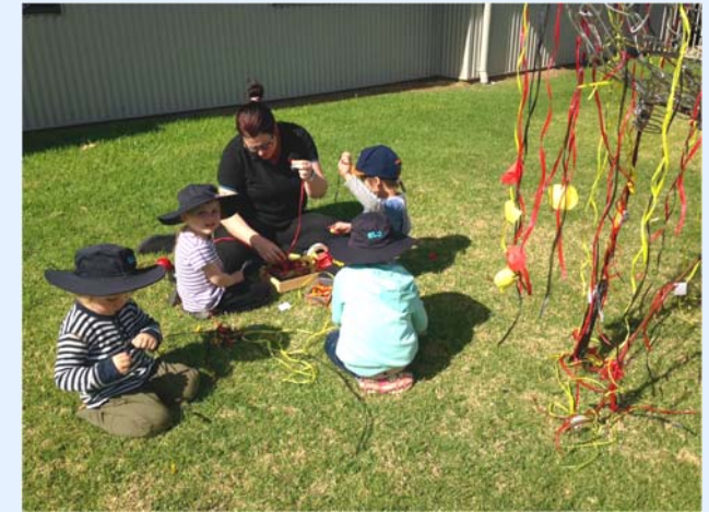
Yamagarra (the Emu sculpture) being decorated in the NAIDOC colours by children of the Bogan Shire Early Learning Centre.

Heritage and Culture: Council has continued to support the Nyngan Museum and the Mid State Shearing Shed Museum. Council also promotes the Museum and the Shearing Shed Museum on its website and newspaper column. Council has been proactive in the development of Heritage Park in Nyngan, with the installation of the Heritage railway crossing gates as a feature, and the construction of the sandstone circle commemorating those from the Nyngan district who served in the major battles of the first World War. Plans are now underway to extend Heritage Park to incorporate a specific Indigenous heritage area.