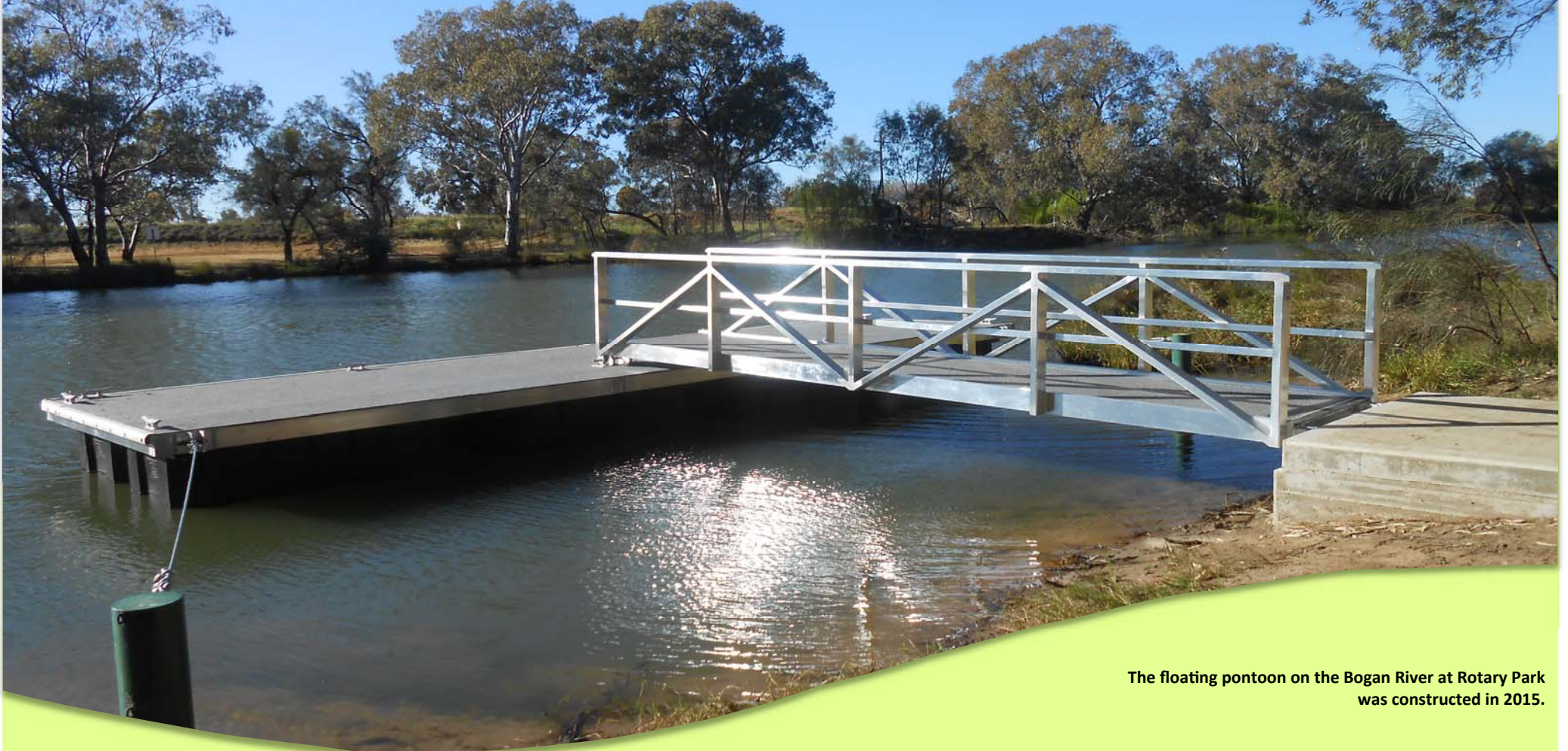
The floating pontoon on the Bogan River at Rotary Park was constructed in 2015.

Goal - To support the current and long-term liveability of our Shire by enhancing and protecting our environment through sound urban planning, managing our waste stream and sewerage services, and providing potable water supplies that are economically sustainable, reliable and environmentally responsible.