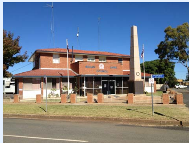
The Bogan Shire Council Chambers building at 81 Cobar Street, Nyngan.