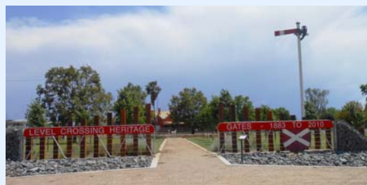
Heritage Park has been developed to include a war memorial and will include an indigenous area.