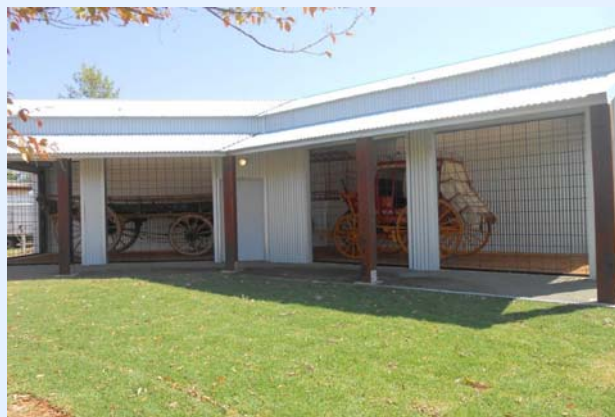
The shed at Teamsters Rest housing the Cobb and Co Coach and a wool wagon.

Youth Centre: The CSP identified a need for a dedicated youth centre. Council supports community groups including the Nyngan Baptist Fellowship through the provision of financial assistance to pay rates and service charges on the former Scout Hall.