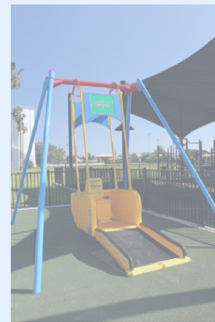
With support from various community organisations, a Liberty Swing and disabled toilet was installed in O'Reilly Park in 2016 for wheelchair users.

Additional disabled parking has been included in the CBD as part of the Main Street Beautification program.