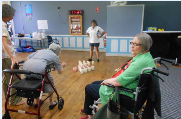
Council helps co-ordinate Seniors Week activities every year.

Traineeships: Council has introduced three specific Council-funded traineeships in the Corporate Services, Engineering and Development & Environmental Services departments. An additional six apprenticeships and traineeships are funded by Council, and are advertised within the local community and marketed towards those about to finish secondary school or to young people wanting to gain a trade certification or commence a career path into these fields.