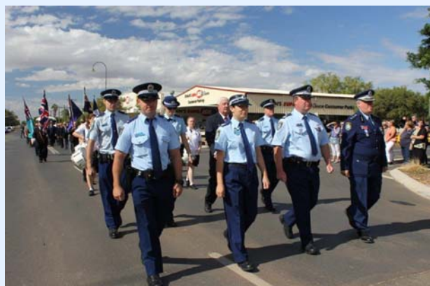
Council has lobbied to ensure adequate numbers of police and ambulance officers are stationed in the Shire.

Council has continued to lobby the State Government for police numbers to be maintained in the Bogan Local Government area. It has also undertaken a commitment with NSW Police to contribute to the provision of housing (where possible) for police officers. Council has made available the flat behind the old ambulance station for police housing. Council attends regular Community Safety Precinct Meetings where there is an opportunity to discuss community safety concerns with senior members of NSW Police.