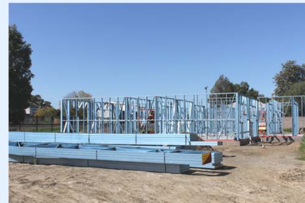
Council commenced work on the Medical Centre in 2016. The facility will cost $1.4 million to complete, and will house two GP's and provide rooms for allied health.

Ambulance Service: Council has lobbied the State Government to ensure Nyngan has access to a 24 hour ambulance service. The use of ambulances for non-urgent patient transport resulted in occasions where there wasn't staffed vehicle available to residents of the Shire. Council successfully advocated on behalf of the community and local health services to ensure the ambulance service is adequate.