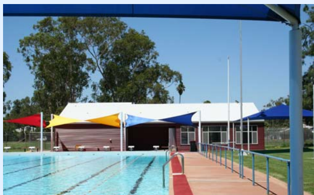
The Nyngan Swimming Pool has a new filtration plant, shade shelters and a club house.

Nyngan Swimming Pool: Council has undertaken extensive renovations of the Nyngan Swimming pool over the past four years. This has included the installation of a new water filtration plant, new diving blocks, the construction of a clubhouse, new BBQ facilities and the erection of new shade cover. There has also been ongoing routine maintenance such as retiling areas of the pools, and a repair to the diving board spring mechanism. Council has reviewed the operating contract for the pool to suit seasonal conditions.