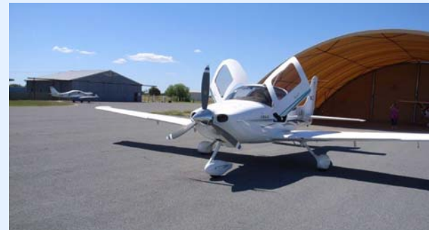
The apron and taxi way at Nyngan Airport were resealed and a second Illuminated Windsock was installed to meet CASA regulations