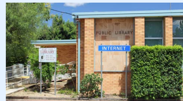
The Bogan Shire Library - a hub of activity in Nyngan.